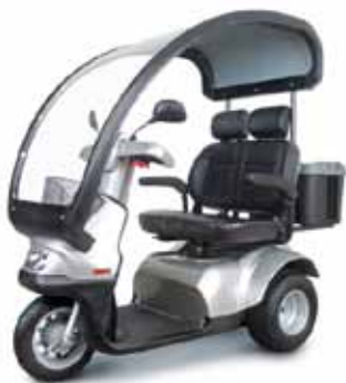
Dual seat with wide wheels canopy