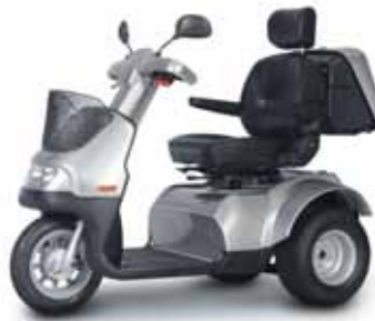
Single seat with wide wheels