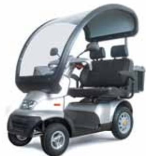
Dual seat with canopy