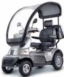
Single seat with canopy